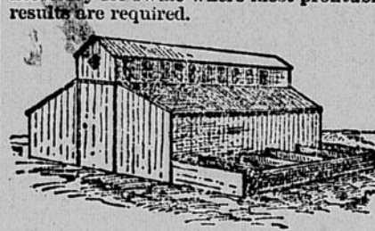
FIG. 1.—OUTSIDE VIEW OF PIGGERY. This house may be cheap or expensive, to suit the taste and means of the owner. A very good piggery is shown in the accompanying illustrations, sketches of which were furnished by an Iowa correspondent, to The American Agriculturist. The building, a prospective view of which is given in fig. 1, is twenty feet wide and may be made as long as necessary. sary to accommodate the number of swipe to be kept. Yet it is not advisable to keep too large a number in one house; when more than seventy or seventy-five are to be raised it is advisable to build additional

Farmers ought to provide for swine protection from the heat of summer and the cold of winter a place where the young pigs can be fed by themselves, and where fattening as well as breeding stock may receive proper treatment. A good pasture in summer and a sunny yard in winter are the best places for pigs the greater part of the year; but during certain seasons some kind of a house is quite necessary for swine where most profitable