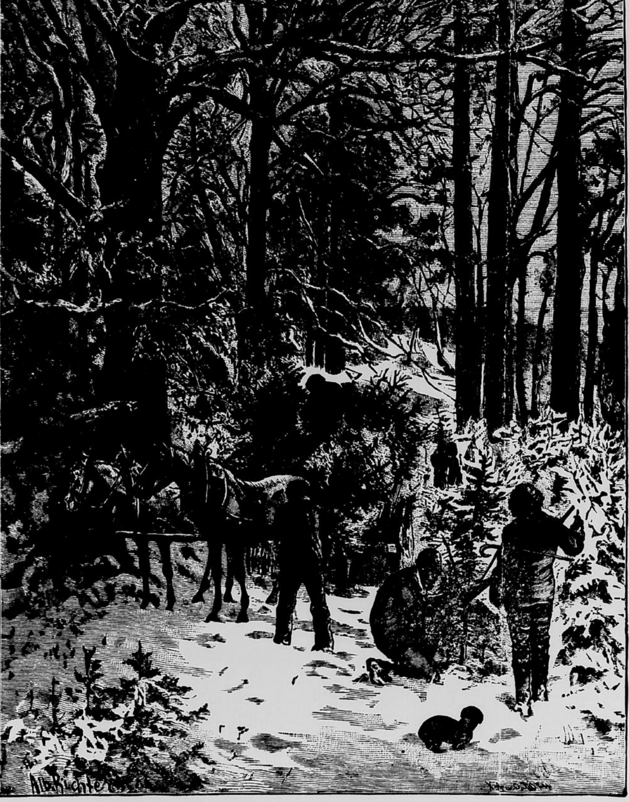
WHERE THE MEN WERE CUTTING CHRISTMAS TREES.

"Miles from here, weeks after that day, they found a body in the woods, and we