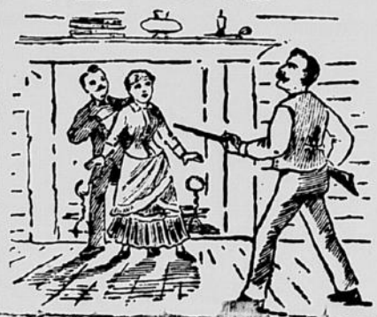
At the woodman's cabin.

recious is her love to me now! ville. The trail in the snow is very fresh. I quicken my pace. I reach the lawn See! The trail leaves the road and leads