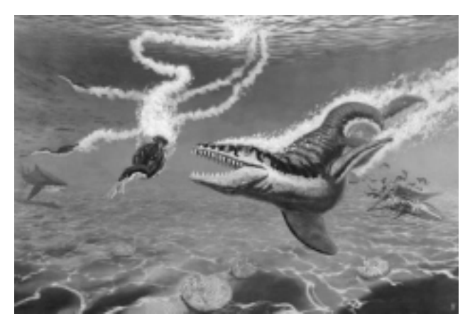
Figure 7. Habitat reconstruction painting by David Miller depicting life in the ocean that covered North Dakota about 75 million years ago based on fossils recovered from the Cooperstown site. A large mosasaur ( Plioplatecarpus ) is attacking a flightless seabird ( Hesperornis ). Hesperornis , also a predator, has captured a salmonlike fish ( Enchodus ). A large shark, similar to the living sand-tiger shark, cruises near the ocean floor.

predatory mosasaur Plioplatecarpus attacking a large, flightless, diving seabird called Hesperornis (Fig. 7). Hesperornis, also a predator that possessed small, sharp, pointed teeth, has just captured a salmon-like fish (Enchodus). Other fish, including a large shark similar to the living sand-tiger shark, cruise this shallow water ocean. Invertebrate animals, snails and clams, reside on the ocean floor. In the background, a decaying carcass of a mosasaur has settled to the bottom. This carcass is being scavenged by a school of small dogfish sharks (Squalus). This was the fate of the Cooperstown mosasaur when it died. Evidence for this is the thousands of small dogfish shark teeth found with the Cooperstown mosasaur skeleton and gnaw marks created by dogfish sharks noted on some of the mosasaur bones. This painting, depicting a moment of time in North Dakota's geologic past, was enlarged to a 8-foot-by-12-foot mural and is mounted on the wall behind the suspended mosasaur skeleton.